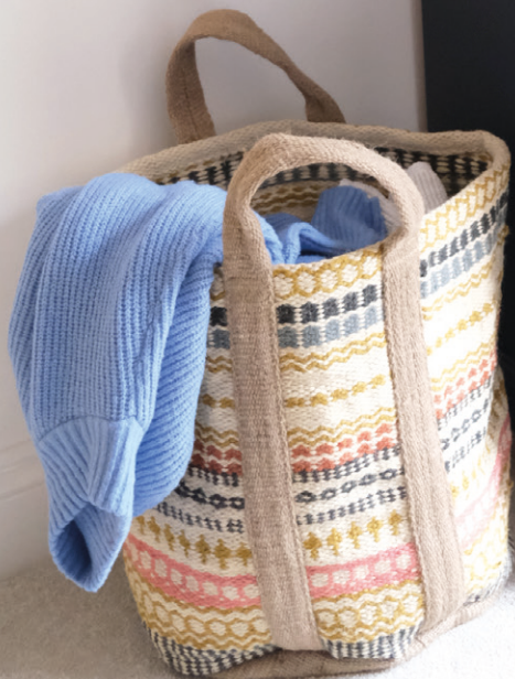
901009 Multicolour Pattern Storage Bag